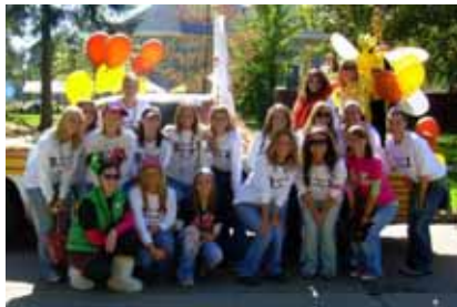
Above: Gamma Alpha Chapter was chosen "most spirited" during Homecoming 2006.

During Homecoming week Gamma Alpha Chapter won the Breezer's Cup, awarded to the week's most spirited organization, for the fifth year in a row. In addition, one of our new members was crowned Homecoming Princess. Our Crush Gram philanthropy event brought in over $100, and sisters were informed of the dangers of drunk driving by our Alcohol Awareness Week speaker.