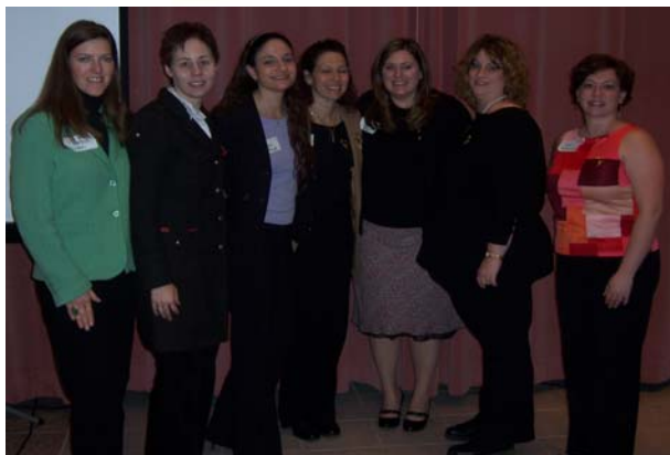
Right: The Youngstown Alumnae received the "Traveling Gavel" Award for having the highest number of paid Alumnae Chapter members in attendance at the 2006 Ohio DZ State Day.

the day with a Senior Ceremony hosted by the alumnae of the Youngstown Alumnae Chapter. Kappa Iota Chapter at Wright State University is looking forward to next year, when they will host State Day on April 21, 2007. 🍀