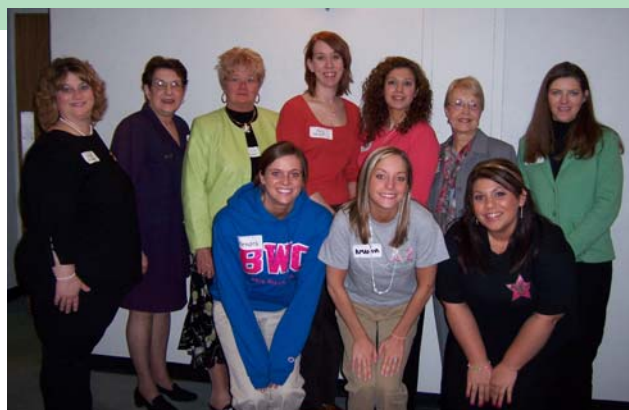
Above: Collegians from Gamma Alpha and Kappa Chi pose with the alumnae attendees of the "Staying Connected in Delta Zeta" workshop.