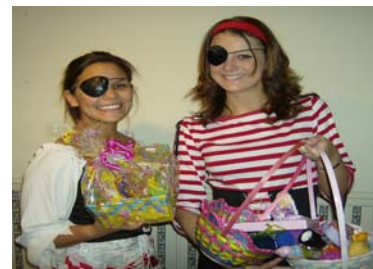
Gamma Alpha members pose in costume after assembling Easter baskets at a "Pirates of the Caribbean" themed event.