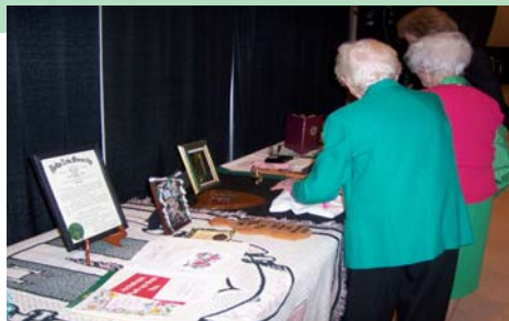
Above: Alumnae browse the "Nostalgia table" at State Day 2007.

"Delta Zeta Diamonds are a Girl's Best Friend" was the theme of the 2007 Region V State Day, hosted April 21, 2007 by Kappa Iota Chapter at Wright State University. Between 350-400 collegians and 50-60 alumnae, the most in recent history, were in attendance.