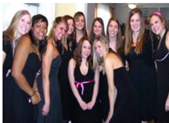
Above: Theta Chapter members gather at recruitment.

This semester, Theta Chapter participated in Buckeyethon, a 14-hour dance marathon which raises money for Children's Hospital, and won most Greek participation points! We created our own Service Day this quarter, and sisters traveled around the Columbus community