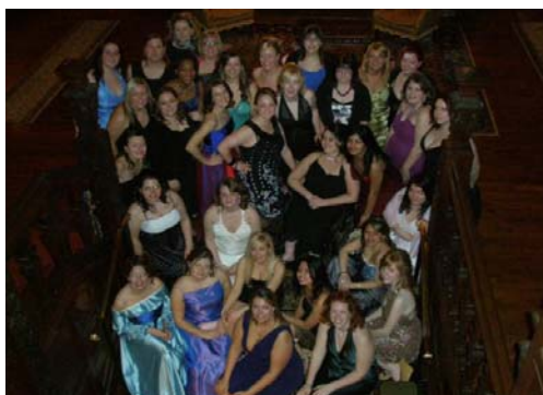
Right: Omicron Nu collegians and alumnae at the Reminiscence of 1902 formal.

We raised $547.00 for the Special Olympics in the first annual Phi Kappa Theta Polar Plunge on February 16. The six members of the "DZ Plungers" team solicited friends and family and went door-to-door offering to take out trash for donations. Delta Zeta was the only sorority of the nine invited to brave the icy waters. We travel with members of other sororities to an elementary school in one of Ohio's poorer, rural areas to serve lunch to the children. This spring we held a cornhole tournament to benefit the Starkey Hearing Foundation. We are planning a drive to collect items from the wish list for My Sister's Place, a local battered women's shelter.