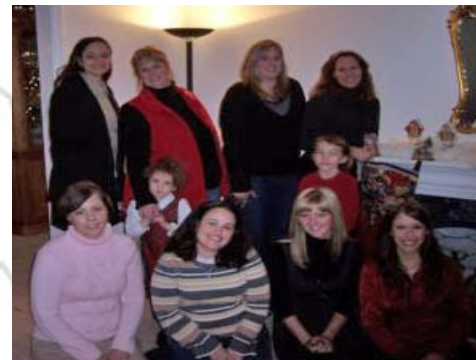
Right: Youngstown Alumnae and legacies gathered for the holidays.

This December, in lieu of our annual fund raising auction, we decided to purchase much needed supplies for the Sparrow's Nest. This may become an annual event.