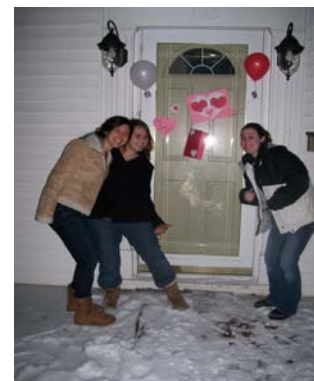
Above: Zeta Kappa members at their "Heart Attack" event.

To show appreciation to our fellow Greeks, we hosted a "Heart Attack" event the night before Valentine's Day in which sisters decorated fraternity and sorority doors in hearts. We are planning our annual Buy-A-Woo fundraising event to auction off sisters for tasks such as laundry, cleaning, and cooking. We will be participating in Relay for Life and have raised over $1,200.00 so far. We have also adopted a troop in Iraq to send letters to, and will have a dirt ice cream area set up for Lil' Sibs Weekend. Last quarter, our chapter had the highest GPA of all Greek organizations at ONU. 🌱