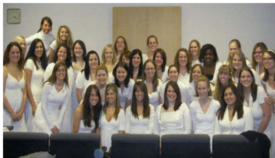
Left: Kappa Iota members at Initiation.

We participated in BGSU's Dance Marathon to raise money for Toledo Children's Hospital. Some members participated while others served as Moralers, supporting the participants who were on their feet for 32 hours. We have participated in intramural soccer, volleyball and softball. We hosted a Mother's tea and received the most improved GPA Greek life award, after increasing from a 2.81 to 3.2 GPA and a rank of second among NPC chapters on campus.