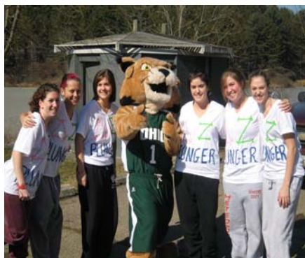
Left: Omicron Gamma "Plungers" at the Polar Plunge.